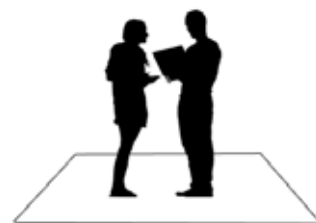
Exhibit space, Exhibitor badges